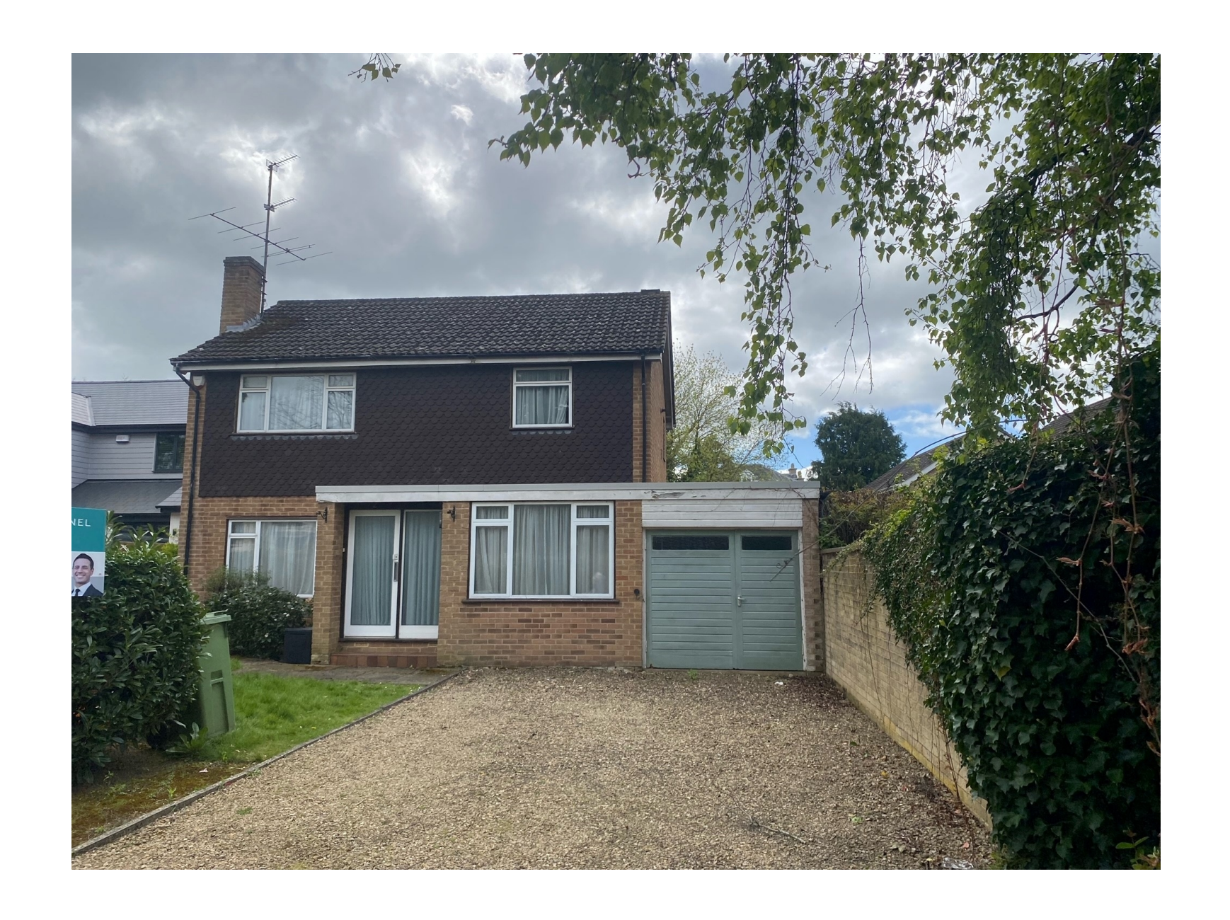
Site Photo - Existing front