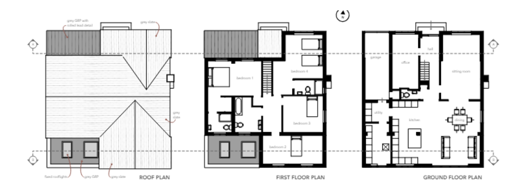
Proposed Plans and Elevations